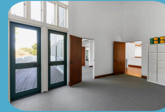
Sage Room 8 people