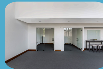
Bloom Studio I 4 people