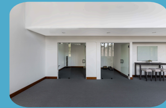
Bloom Studio II 4 people