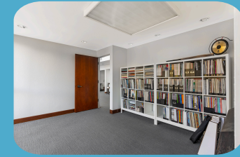
Cedar Room 6 people