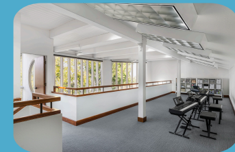
Firefly Loft 16 people