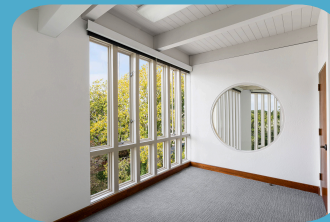
Glasswinged Suite 10 people